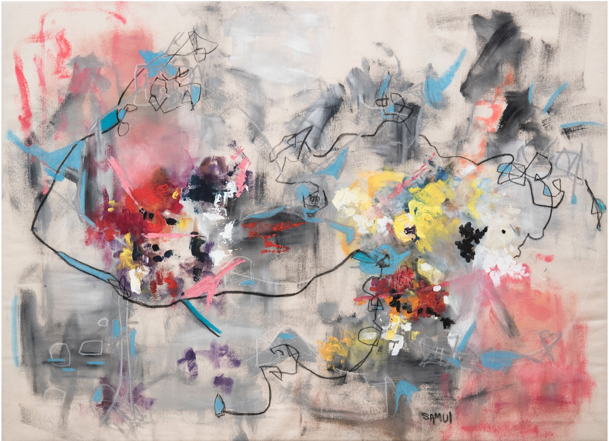
Jamie Samul, Abstract 21 , 2018, acrylic, pastel, and charcoal on canvas, 53 x 38"