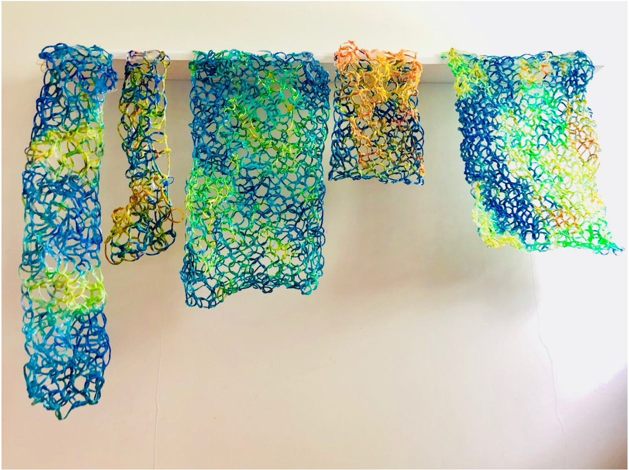
Yana Rodin , Evanescent Aquatica , 2018, acrylic on polyester nylon